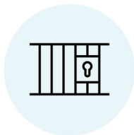
Law School Jumpstart