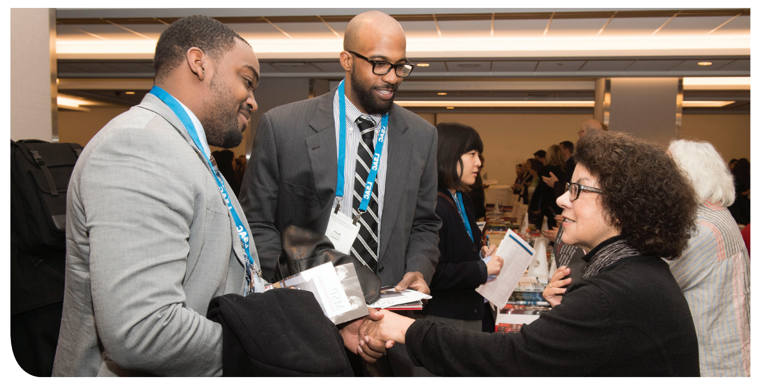
Cover photo and photo above: Future lawyers network with admission professionals at the LSAC Law School Forums.