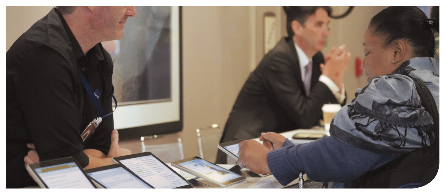
Photo above: LSAC Ambassador demonstrates the LSAT familiarization site on tablets.