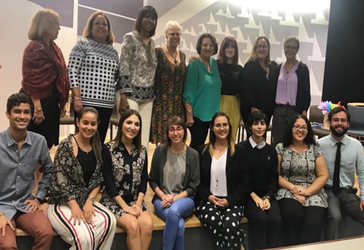
PRESENTATION OF THE DOCUMENTARY SER FAMILIA AT THE UNIVERSITY OF PUERTO RICO SCHOOL OF LAW, 2018.