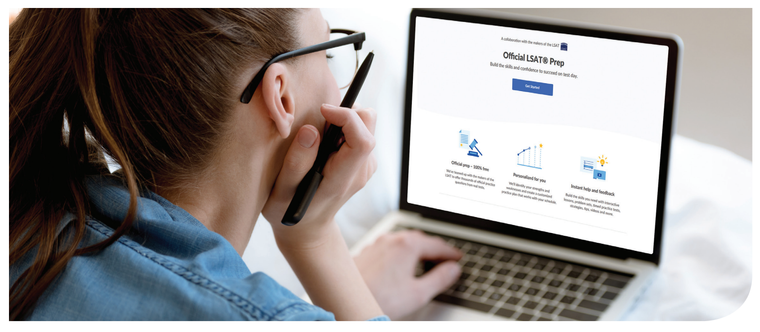
Photo above: Future law student using Official LSAT Prep from the Khan Academy website